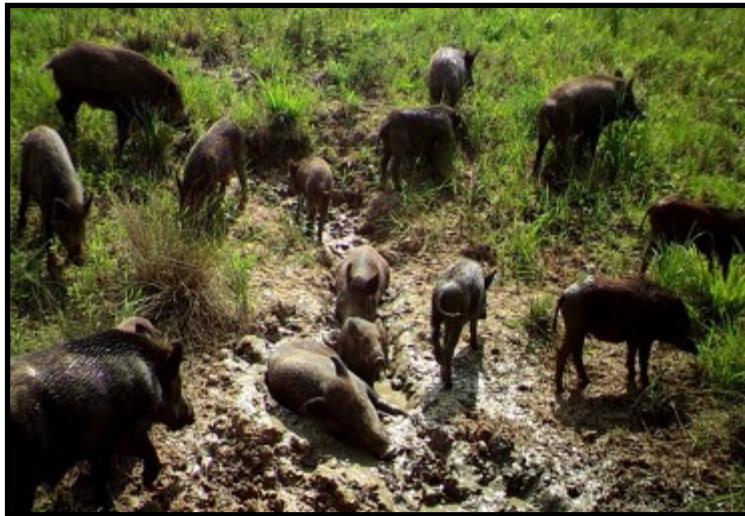
Hogs Rooting in a Spring

with a farm adjoining the park he learned of severe hog damage to pastures too. After consulting with USDA staff and Oklahomans with long experience with hogs, he tried numerous methods of killing them, including shooting at night, but he had the most success using traps he himself designed, installed, and monitored each morning before work. Over the next few years he trapped some 200 hogs on private lands adjoining both Johnson's and Taum Sauk Parks, since park officials at the time were leery of trapping on park land.