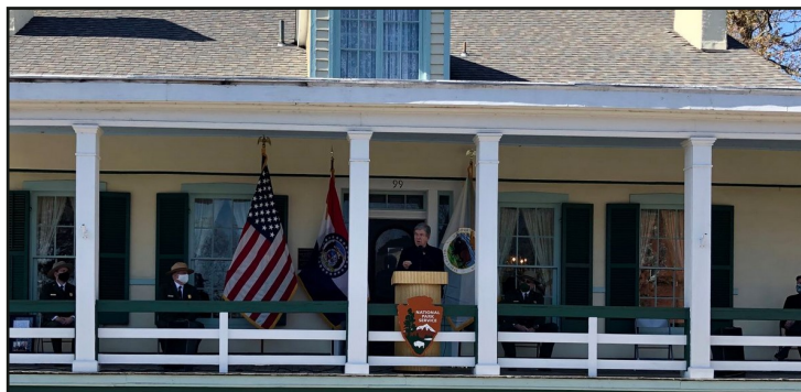
Sen. Blunt speaking from the J.B. Valle House

min Shaw houses, even as they were preparing to transfer their other properties to NPS to join the Bauvais-Amoureux house, which had been transferred earlier. From all indications during informal discussions that followed the event,