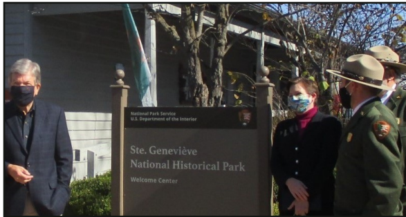
Sen. Blunt and DNR Director Comer with NPS Staff

Heritage articles, and resolutions going back to 1989, as well as copies of the state park book, that convey MPA's strong sense of the importance of the Big Common Field as a cultural landscape of surpassing significance for the interpretation of the new national park. The Old Town Archaeological Site in the common field, the only remnant of the original townsite still remaining from the first half-century of Ste. Genevieve's history that was not obliterated by channel changes of the Mississippi River, needs to be in NPS ownership so it can be studied for clues to that critical period. It is straight out from the vertical-log Delassus-Kern house that the state will soon be transferring to NPS. And the Bauvais-Amoureux house fronting on the common field and already transferred from MSP to NPS is the perfect place to interpret the vital importance of African Americans, both enslaved and free, in the life of the community.