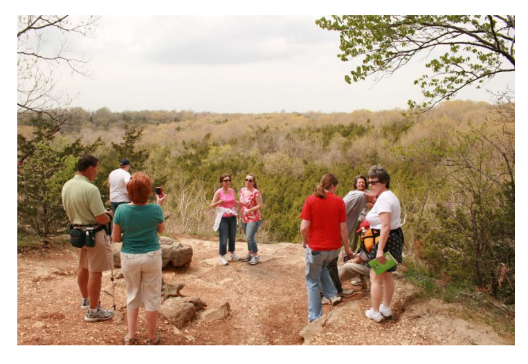
View from Shooting Star Bluff

There are just twelve places in the state of Missouri that meet these wild area criteria. The Gans Creek Wild Area is one of those twelve. The state park's website describes it like this: "The solitude and scenic vistas of the 750-acre Gans Creek Wild Area allow visitors to forget the bustling city of Columbia is only a few miles away. Small streams dissect the hills and flow into Gans Creek, which is surrounded by high bluffs. The bottom and sides of Gans Creek are often solid bedrock while other stretches of the stream have gravel bars. Except during heavy rain events, the water flows slowly over riffles and into pools. Spring wildflowers are abundant. Basswood and walnut trees grow on moist, shaded hillsides. Scattered white oaks grace more open forested area. The rocky bluff tops have small glade openings filled with grasses and wildflowers. Coyote and Shooting Star bluffs provide vistas of hills and trees as far as the eye can see."