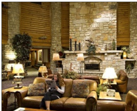
Emory Melton Lodge at Roaring River, built with revenue bonds

Highly sought by DNR and MSP was inclusion in the state parks budget of authority to issue some $60 million in revenue bonds to enable new or upgraded campgrounds, lodging, and other facilities that could be repaid within ten years by earnings of the new facilities. Revenue bonds had been used years ago (e.g., the Emory Melton Lodge at Roaring River), but the projects now authorized in twenty-two parks statewide will be a major advance for the system. For a list, https://bit.ly/3cyhclZ