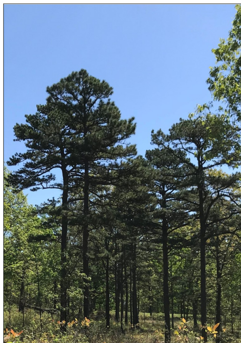
Shortleaf Pine – Stellata NA

mill complex, beyond which stretched expanses of mine tailings