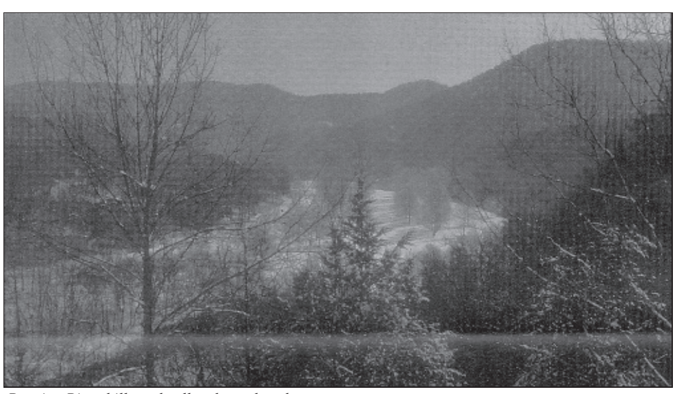
Roaring River hills and valley through cedars.

Restoration ecology endeavors to maximize biodiversity by restoring natural landscapes with species and biotic communities that were present prior to Euro-American settlement but that have been affected by recent human activities. A variety of clues are used to determine the nature of such presettlement landscapes; and when the still-evolving