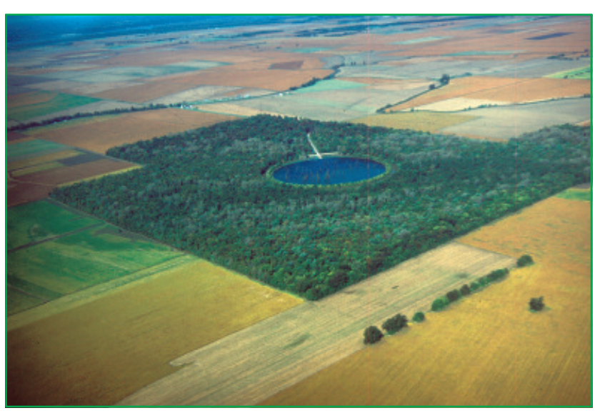
Missouri Department of Natural Resources aerial view of Big Oak Tree State Park.