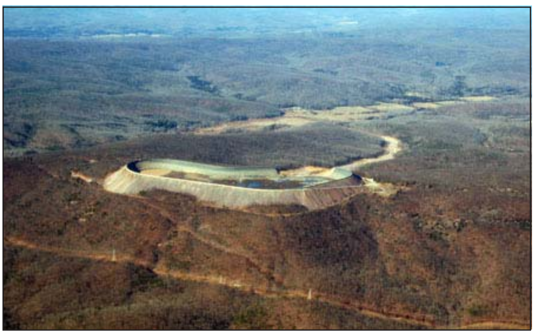
An aerial view of the breached reservoir looking down the scour channel toward the park.

As it was, the dam was overtopped but the water downstream rose only about two feet.