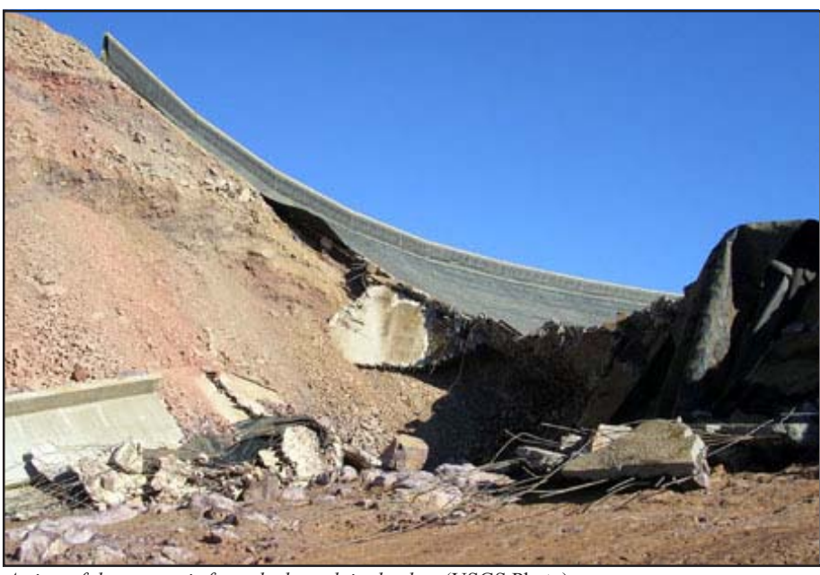
A view of the reservoir from the breach in the dam (USGS Photo).

Ironically, the observations were made on a Sunday when workers are not ordinarily at the plant, but they were getting ready for a ceremony the next day at