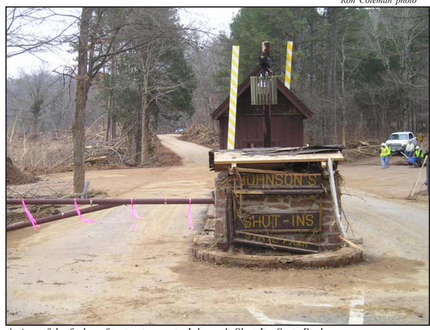
A view of the forlorn front entrance to Johnson's Shut-Ins State Park.