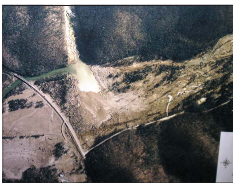
Aerial view of the park looking east across Black River at scour channel (top left) showing debris dam and impoundment (center), Route N (left), field where Toopses were found (far left), and entrance road to park (lower right).

Not least among the extraordinary occurrences was that there were no campers in the park the night of the flood, though the campground had been receiving steady use throughout the fall, and no one else was seriously injured or killed despite several trucks being washed from the road. If the breach had occurred during the summer, hundreds of people at the nearly always full park would likely have been injured or killed. And it was fortunate that the dam of the lower reservoir downstream from the park on East Fork Black River held, or a twenty-foot surge would have raced through Lesterville 3.5 miles south and on downstream.