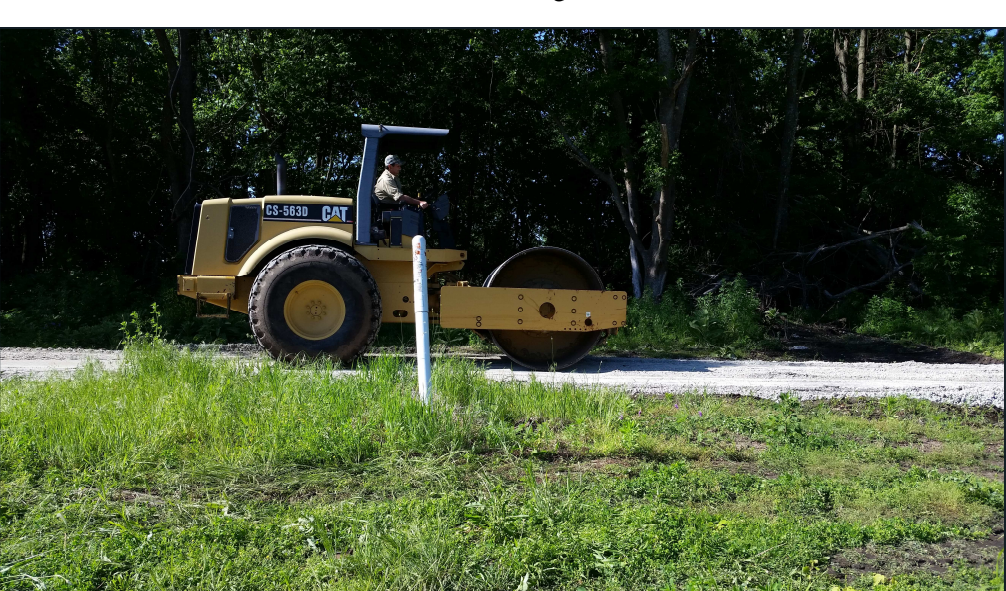
As it turned out, the best option for spending the expiring $15 million productively by June 30 was on a park that was not on either list, though it was eagerly awaited by many Missourians-the Rock Island Trail from its junction with

It was one of the most devastating legislative sessions ever for state parks. Stripping reappropriations for projects already in the works is virtually unheard of, and major state building bond issues like this come